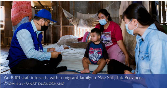
An IOM staff interacts with a migrant family in Mae Sot, Tak Province.