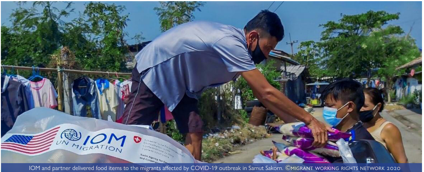
IOM and partner delivered food items to the migrants affected by COVID-19 outbreak in Samut Sakorn.

In 2020, IOM Thailand's activities reached over 220,000 beneficiaries across 36 projects funded by 17 donors.