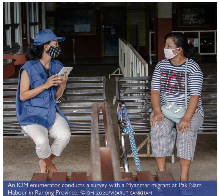
An IOM enumerator conducts a survey with a Myanmar migrant at Pak Nam Harbour in Ranong Province.

423 attended workshops, conferences and meetings organized by IOM Thailand.