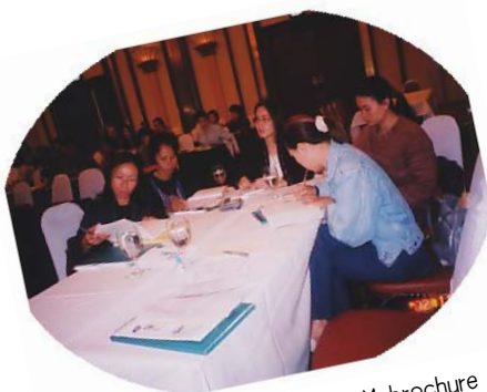
Picture from the SEPOM brochure

Address: 120 Moo 15 Robvieng Chiang Rai 57000, Thailand Telephone: +66 53 756411 Fax: +66 53 756411 E-mail: sepom2002@yahoo.com