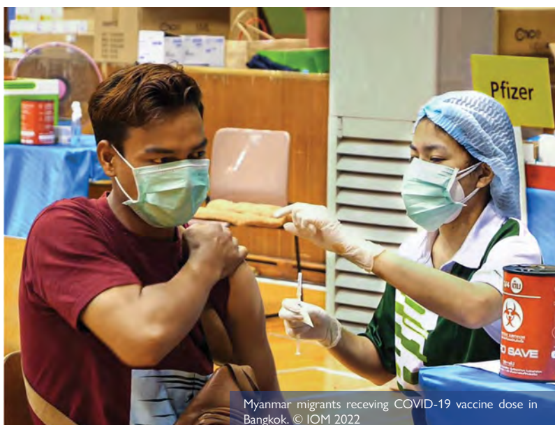
Myanmar migrants receiving COVID-19 vaccine dose in Bangkok.

Project Stakeholders: Government agencies, public health officials, vaccination centers, civil society organizations (CSOs) and academia.