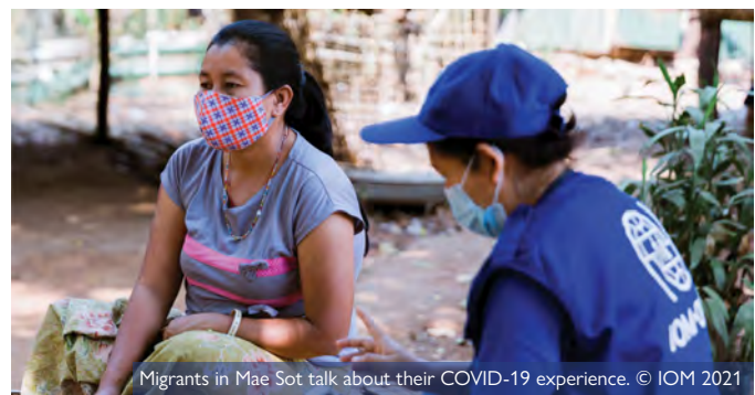
Migrants in Mae Sot talk about their COVID-19 experience.

Through its COVID-19 Vaccination Support Project, the International Organization for Migration (IOM) has been working to protect the health of migrants in Thailand by involving migrants in the pandemic response, ensuring that they are kept well-informed have access to vaccination.