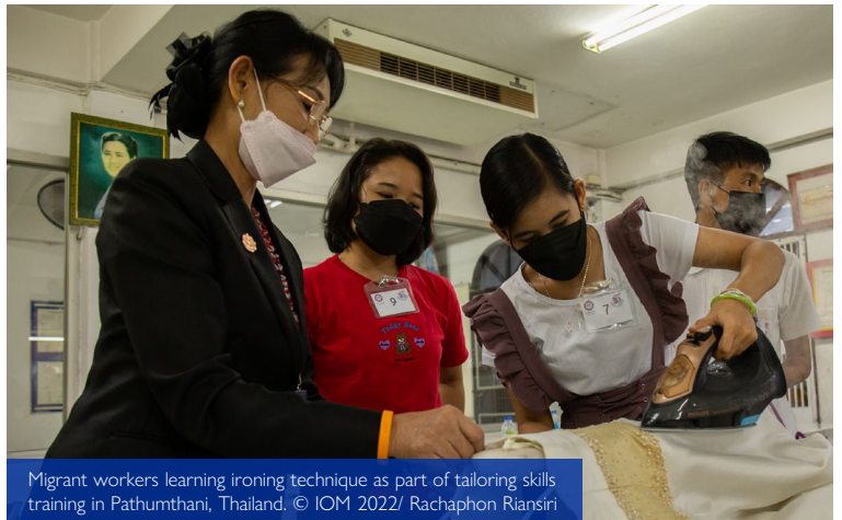
Migrant workers learning ironing technique as part of tailoring skills training in Pathumthani, Thailand.

Great strides were also made on migrant inclusion in skills development, with the Ministry of Labour encouraging employers to invest in the Skills Development Fund for migrant workers. In 2022, over 163,620 migrant workers from Cambodia, Lao People's Democratic Republic and Myanmar benefitted from in-service training funded and conducted by their employers.