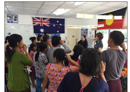
Trainers involve participants in interactive activities.

This is achieved over the course of five days with 15-25 contact hours. AUSCO trainers use a variety of teaching methods throughout the course including brainstorming, simulations, case studies, discussions, problem solving and role plays. Course content is supplemented by AUSCO Student Folders available in a number of languages, and an 'Activity Book' to reflect upon and record the participants settlement journey.