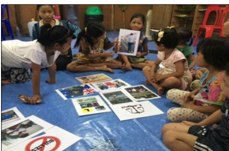
A group of children discussing and determining legal activities in Australia.

Duration of the pre-departure AUSCO cultural orientation program