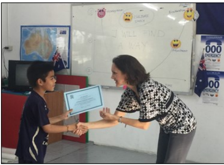
A child is presented with a certificate of completion by IOM Thailand's Chief of Mission.