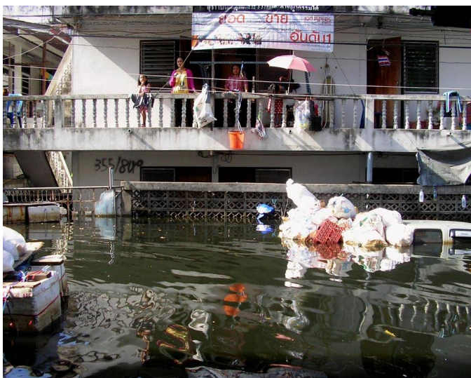
Hundreds of migrants and Thai residents were stranded in the buildings around Si Moom Muang with water up to 2 meters